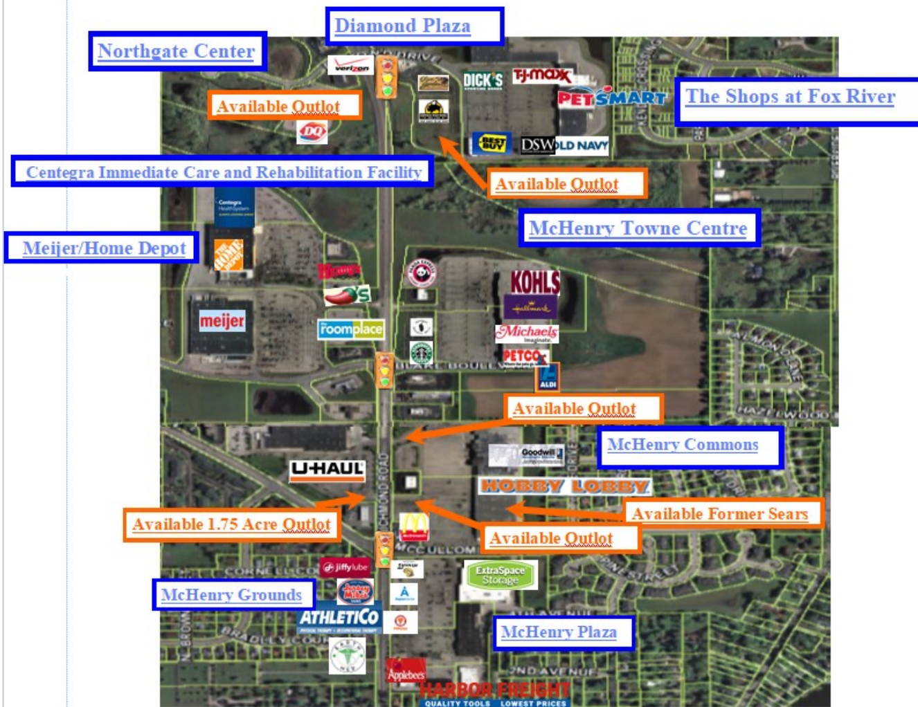
Aerial View of Richmond Road Corridor, Looking North (1,358,353 square feet of total retail space)